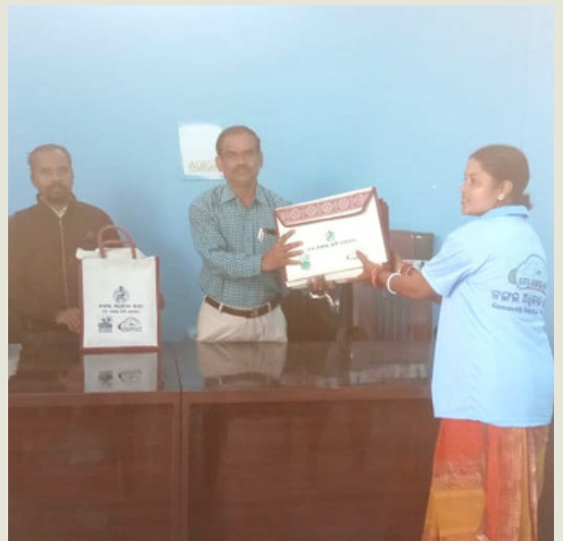
Sukruli Tehsil in Mayurbhanj