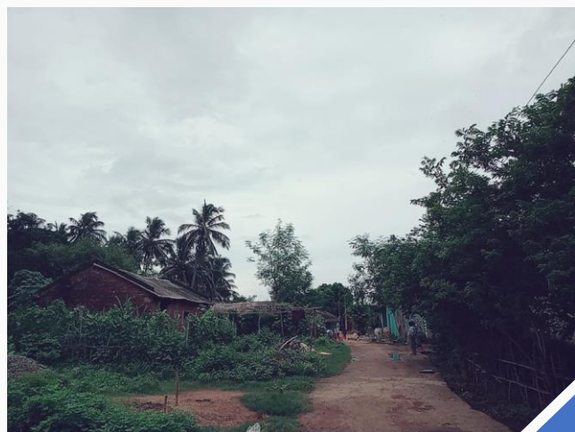
(L) The dense forests around Nathapur; (R) A portrait of Nathapur village

The Kondh Adivasi community of Nathapur village in Nayagarh district have been protecting the Tangi range forests for several decades. In fact, in the Ranpur block, women have had a long tradition going back to as many as 40 years of conserving forests. Despite this, their CFR rights have not been legally recognised. Nathapur villagers had realized the importance of forest and the role played by them in their lives early on, before the current climate crisis was apparent to many.