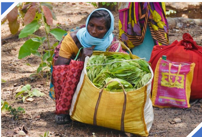
Forest Dwelling woman with the Tendu leaf harvest of the day

This year during lockdown, the Federation of 29 villages earned INR 2.5 crores by selling Tendupatta, while managing everything themselves and taking precautions against the spread of COVID19. Furthermore, the Federation had used the substantial profits from sales in 2017 of Tendupatta to rent machinery to dig ponds or waterbodies in the Gram Sabhas for rainwater harvesting. The groundwater was recharged in these areas and therefore villagers could also focus on paddy cultivation. When members of the support NGO Vidarbha Nature Conservation Society (VNCS) went to the community to provide relief kits, the community felt self-sufficient and therefore refused to accept these kits.