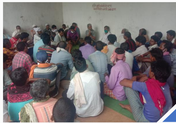
(L) Baiga women walking towards the forests; (R) A meeting of Gramdut Karyakram campaign and a Baiga Gram Sabha

Baiga Chak, an area of dense forests, is primarily inhabited by the Baiga Particularly Vulnerable Tribal Group (PVTG). There are close to 70 villages in Umaria and Dindori districts that are part of this forested belt. Since 2008, the communities with the support of the Gramdut Karyakram and Jangal Adhyayan Mandal, two campaigns working on rights-based awareness, have been working towards recognition of forest rights. While in the initial years of the campaign, individual forest rights were recognised, it is since 2017 that the campaign has focused on the legal recognition of CFRs. Currently, 10 Gram Sabhas of Dindori block have their documents and evidence ready to claim CFR. These Gram Sabhas were ready to submit these to take forward the process of CFR when lockdown was announced.