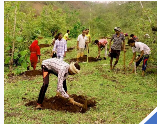
(L) Communities are employed and work for their own forest management; (R) Community planted local trees on CFR areas

Nandurbar district has the second highest acreage of CFR recognition in Maharashtra, where in April 2018, communities had titles over 2,16,723.10 acres of land . The forests have plenty of Bhutya (Gum tree/ Sterculia urens ), Mahua flowers ( Madhuca longifolia ), Cuddapah Almond (Char tree/ Buchanania lanzan ) trees and as part of CFR Management plans, the CFRMCs are guiding to plant more trees that help to support livelihood of forest dwellers.