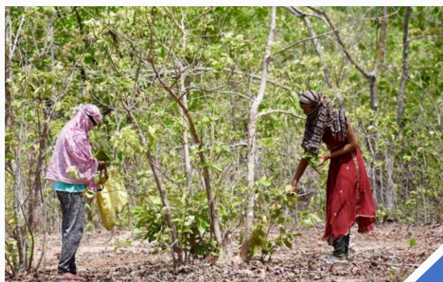
(L) Forest dwellers prepare bundles of Tendu leaf; (R) Women collect MFPs using masks and keeping safe distance

In Gondia district, 75% of the population are Adivasi, mainly Gond and Halba Adivasis. Over here, more than 250 villages have their CFR rights legally recognised, and in Deori block, 29 villages have formed a Federation to carry out their minor forest produce collection and sales. The Federation acts as an elected body that supports and assists the Gram Sabhas. It is governed by two representatives (a president and a secretary), from each of the 29 villages. Each year, the Federation ensures that collectors-the Adivasis and forest dwellers- are paid for all 11 days of their work during the season, unlike the Forest Department which would only buy and pay Tendu collectors for 2-3 days of their labour. Also, while the Forest Department, through its traders, pays collectors only INR 220 per day and seasonal bonuses are as low as INR 25, the Federation pays INR 300 per day and a seasonal bonus of INR 200.