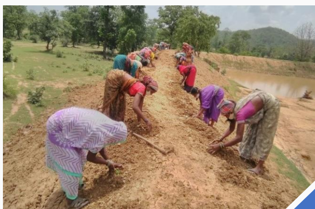
(L) Women clean the Mahua flower harvests; (R) The community carries out their regular CFR management work while maintaining safe distance