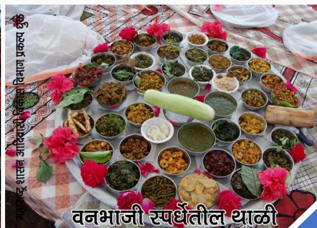
Villagers of Baripada are self-dependent on their own agriculture and forests

In 2017, the individual forest rights (IFRs) and CFRs of around 130 Kokni and Bhil Adivasi families, residents of Baripada village, Gram Panchayat Manjri, in the District of Dhule were legally recognised. Since the forests here are not very dense, villagers are agriculturalists and grow grains and vegetables throughout the year.