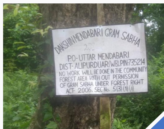
(L) A board at the entrance of Kodal Basti, proclaims Community Forest Rights!; (R) Dakshin Mendabari self-proclaims Community Forest Rights

While CFRs are still officially unrecognised by the government of West Bengal, the Adivasi communities- Rawa, Santhal, Oraon, Mech and Koch and other forest dwelling Van Taungya communities, living in and around the Jaldapara National Park and Buxa Tiger Reserve in Alipurduar district in West Bengal, have been accessing and conserving the forests for several years.