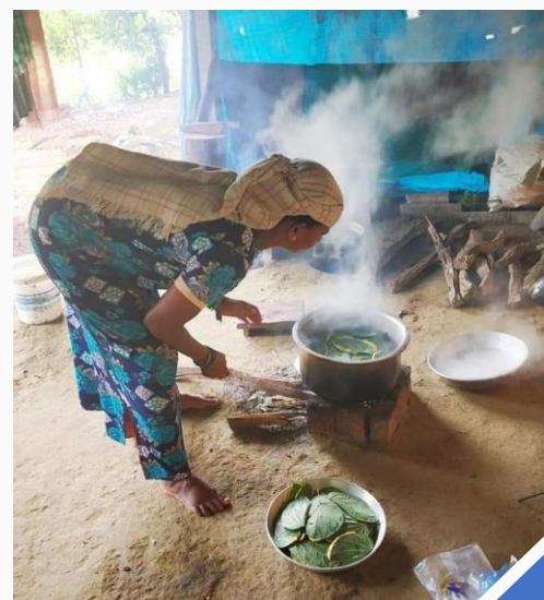
(L) Communities conserve and care for their forests; (R) Preparing a dish using diverse forest foods