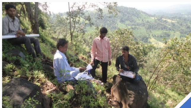
(L) Adivasi communities make their CFR management plans; (R) Mapping of Community Forest Resources

This story is about a cluster of 24 villages situated in the eastern-most part of Dediapada block in Narmada district. All these villages are exclusively Adivasi villages, predominantly inhabited by Vasava tribe, with some Tadvi tribe families in two villages. These villages are also a part of Shoolpaneshwar Sanctuary, which was declared in three phases- in 1982, 1987 and 1989- on 61,542.40 hectares of forest land, and has a total 104 villages, including 25 uninhabited villages.