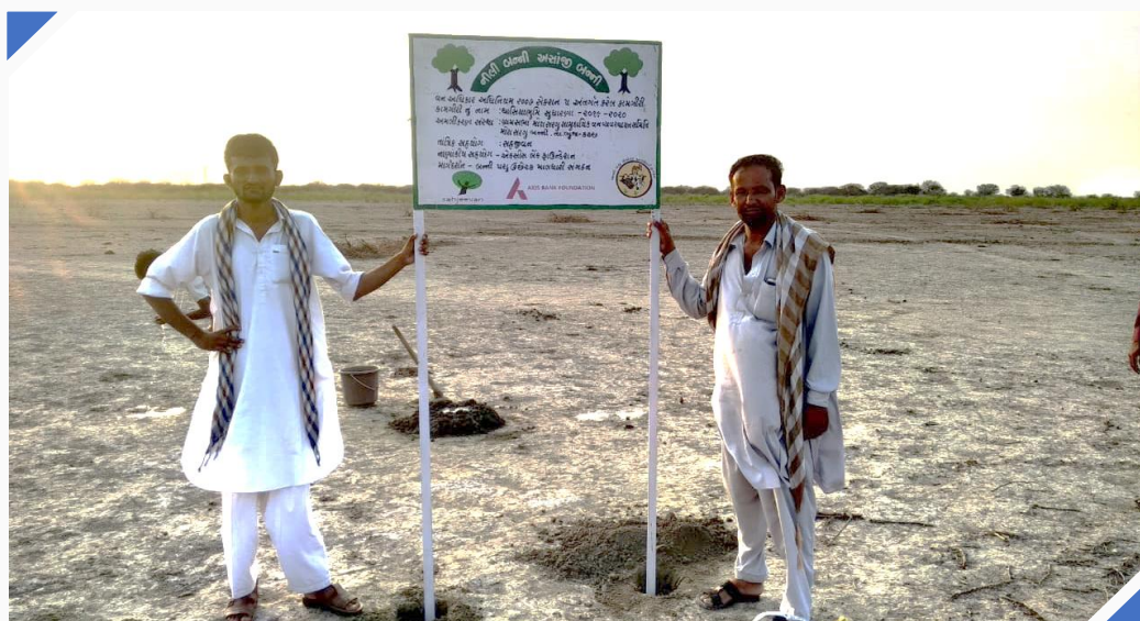
Maldhari pastoralists stand near a sign board proclaiming the Banni Grassland CFR area

The Maldhari communities are mainly dependent on indigenous livestock herding: the Kankrej cattle and Banni buffalo being the most common. Most families have 50-100 livestock, each village around 5000 and the entire area has over 1,00,000 livestock. While the pastoralist community could largely survive on their own milk production, some community members had food shortages. In