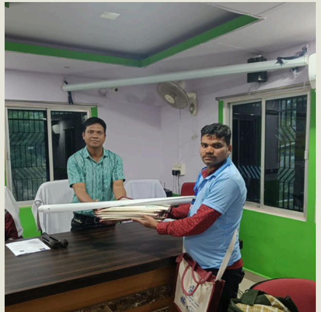
Dasapalla block in Nayagarh