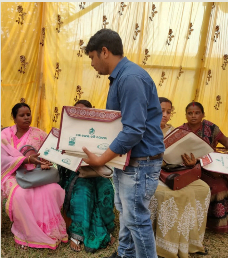
Karanjia Tehsil in Mayurbhanj