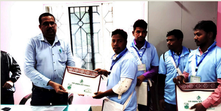
Jashipur Tehsil in Mayurbhanj