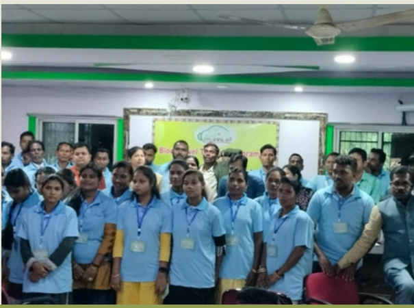
Gania block in Nayagarh