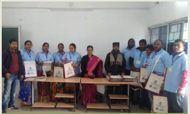
Raruan Tahasil in Mayurbhanj