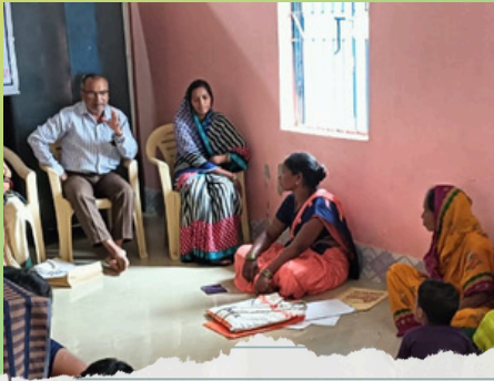
Panchayat level meeting was organised in Pasara GP hall,,where GP sarapanch and OLM staff are particepated.