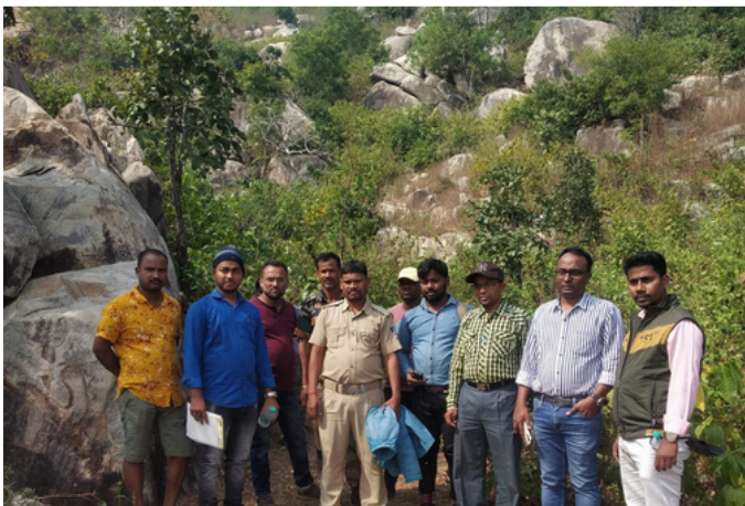
GPS mapping is underway from Managada to Panchalingeswar in the Kuldiha Wildlife Sanctuary, of Shyamsundarpur. The team is accompanied by forest officials, RI, FRA cell personnel, and our team members, covering the entire distance.