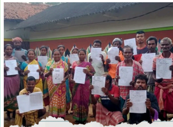
The claim-making process for CR, CFR, and IFR was completed on Friday with the active participation of villagers during the final Gram Sabha meeting at Dhatikidihi village, Mayurbhanj