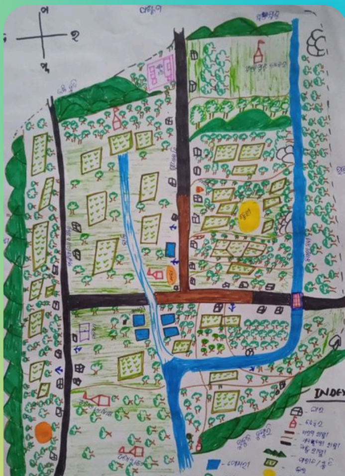
The community members of Suakathi Forest Village have prepared a map of the forest resources in their area. This map shows the community forest resources and is a hand-drawn representation. These techniques have been used for numerous years.