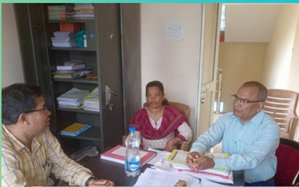
BDO Chakapada has approved our request to open a bank account for MFP collectives in the Chakapada block