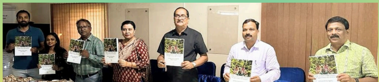
released the Odia translated version of "Guidelines for Conservation, Management and Sustainable use of Community Forest Resources", issued by the Ministry of Tribal Affairs, Government of India on 12th September 2023