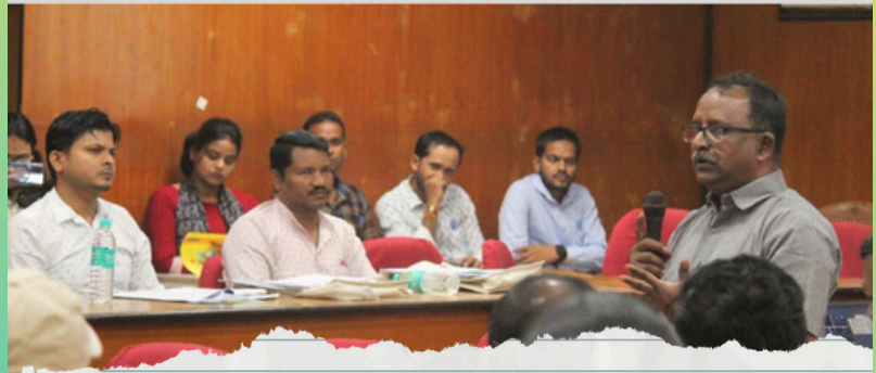
The Balasore District Administration organized two days sensitization cum training program on the Forest Rights Act and Mo Jangle Jami Yojna. It was attended by the frontline officers from different line department.