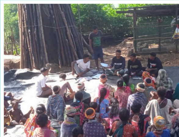
A special meeting of the Gram Sabha, also known as Palli Sabha, was held in Padeiguda village of Khairput block, Malkangiri district.