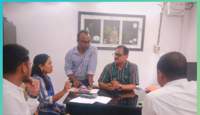
A productive discussion with the district welfare officer (DWO) of Nayagarh district about provisioning a Van Dhan Vikas Kendra (VDVK) .