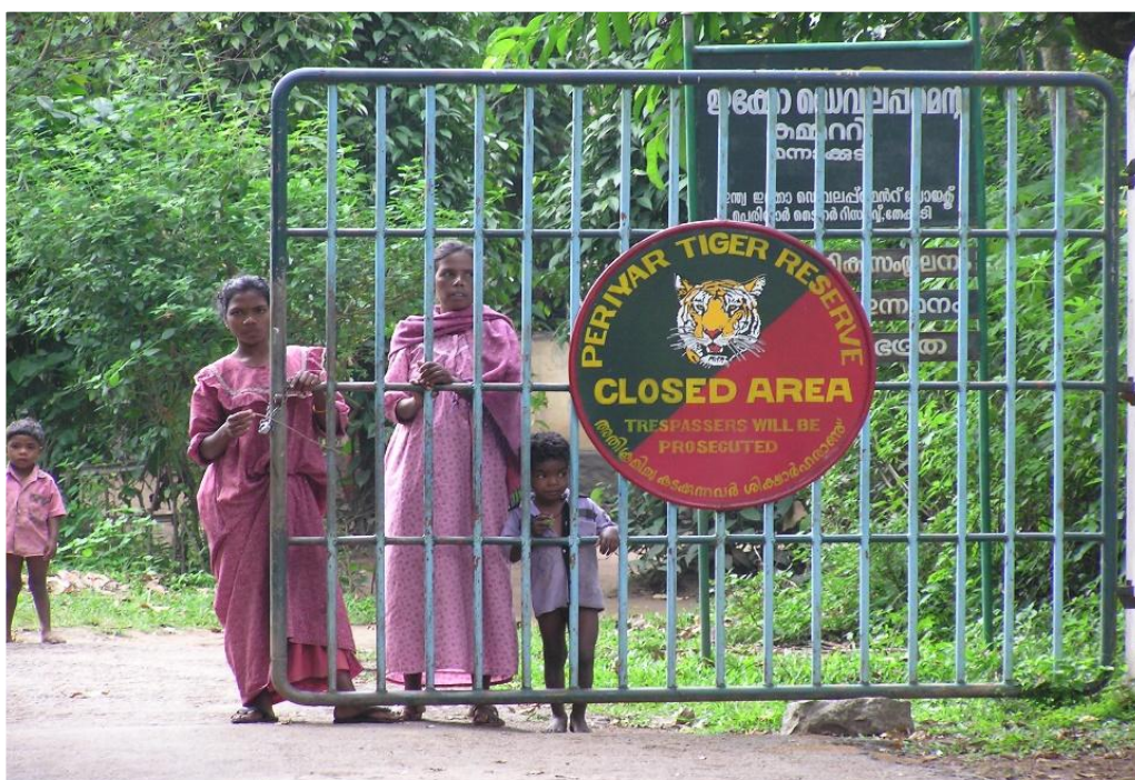
Tribals at the gate of Periyar Tiger Reserve, Kerala;